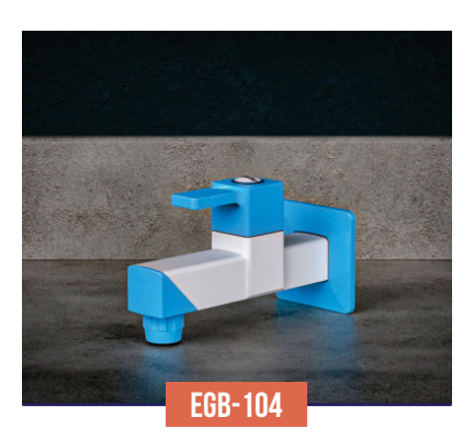
LONG BODY BIB COCK WITH FLANGE MRP: Rs. 421.00