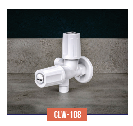
2 IN1 ANGLE COCK WITH FLANGE MRP: Rs. 427.00