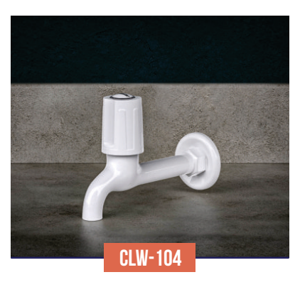
LONG BODY BIB COCK WITH FLANGE MRP: Rs. 261.00