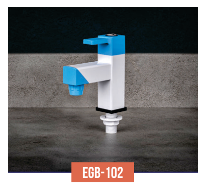
PILLER COCK MRP: Rs. 438.00