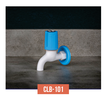
BIB COCK WITH FLANGE MRP: Rs. 188.00