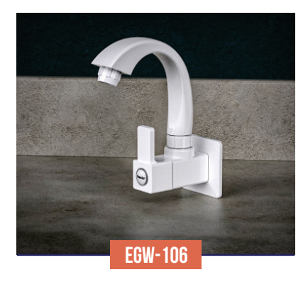
SINK COCK WITH FLANGE MRP: Rs. 750.00