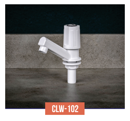
PILLER COCK MRP: Rs. 288.00