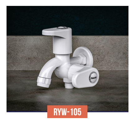
2 WAY BIB COCK WITH FLANGE MRP: Rs. 482.00