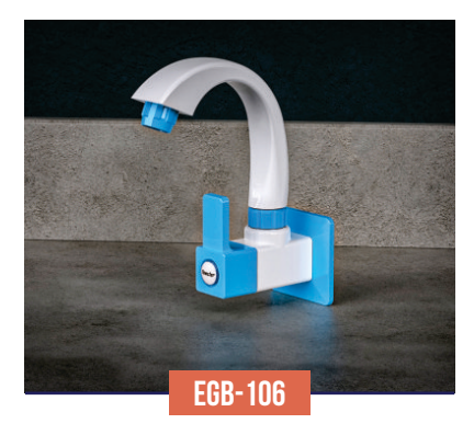
SINK COCK WITH FLANGE MRP: Rs. 750.00