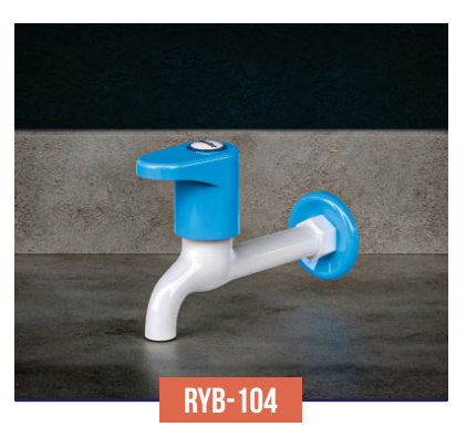
LONG BODY BIB COCK WITH FLANGE MRP: Rs. 299.00