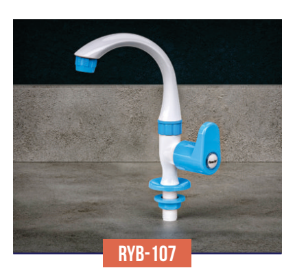
SWAN NECK MRP: Rs. 597.00