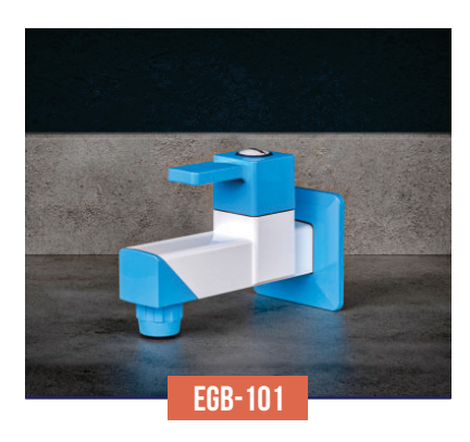
BIB COCK WITH FLANGE MRP: Rs. 334.00