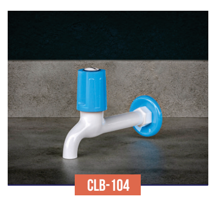
LONG BODY BIB COCK WITH FLANGE MRP: Rs. 261.00