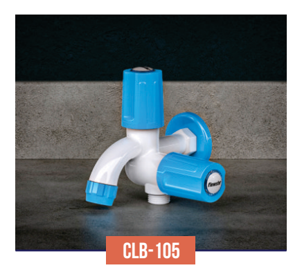
2 WAY BIB COCK WITH FLANGE MRP: Rs. 438.00