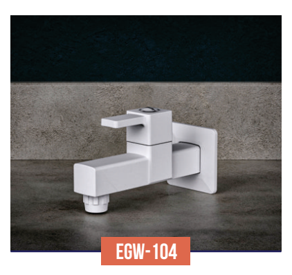
LONG BODY BIB COCK WITH FLANGE MRP: Rs. 421.00