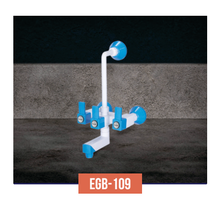
WALL MIXER WITH BEND MRP: Rs. 2246.00