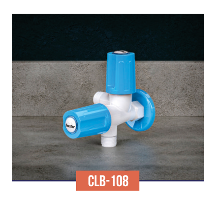
2 IN1 ANGLE COCK WITH FLANGE MRP: Rs. 427.00