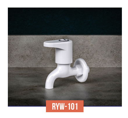
BIB COCK WITH FLANGE MRP: Rs. 221.00