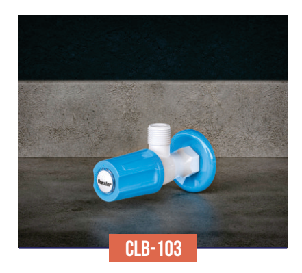
ANGULAR STOP COCK WITH FLANGE MRP: Rs. 200.00