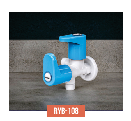
2 IN 1 ANGLE COCK WITH FLANGE MRP: Rs. 472.00