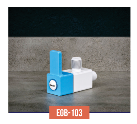
ANGULAR STOP COCK WITH FLANGE MRP: Rs. 295.00