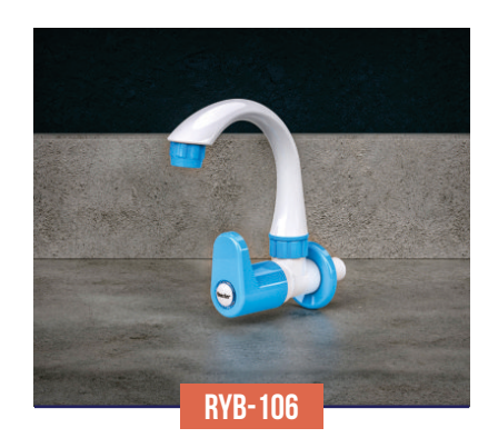
SINK COCK WITH FLANGE MRP: Rs. 600.00