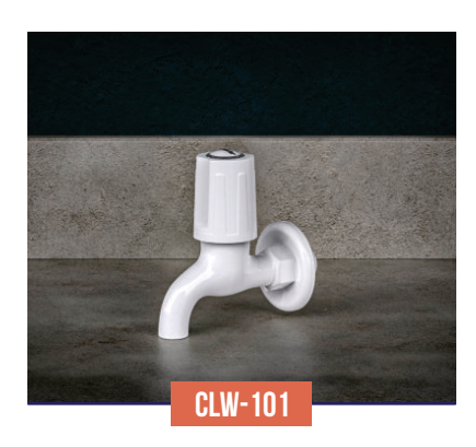
BIB COCK WITH FLANGE MRP: Rs. 188.00