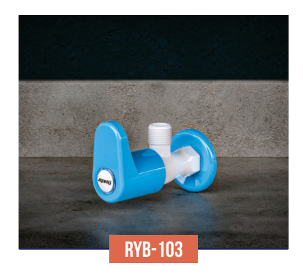
ANGULAR STOP COCK WITH FLANGE MRP: Rs. 234.00