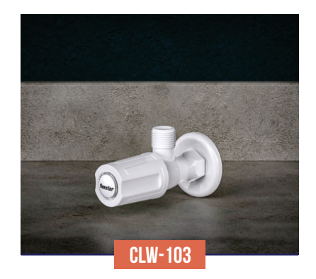
ANGULAR STOP COCK WITH FLANGE MRP: Rs. 200.00