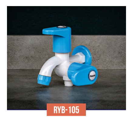
2 WAY BIB COCK WITH FLANGE MRP: Rs. 482.00