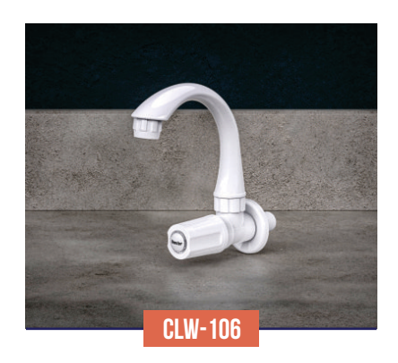
SINK COCK WITH FLANGE MRP: Rs. 533.00