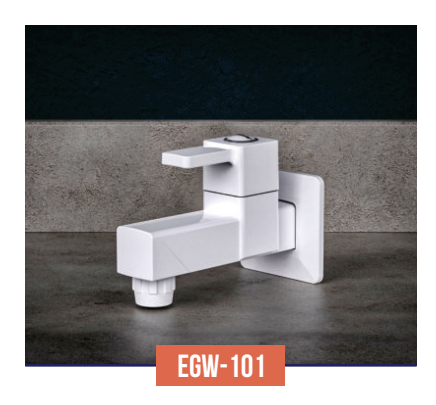
BIB COCK WITH FLANGE MRP: Rs. 334.00