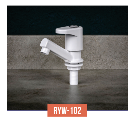
PILLER COCK MRP: Rs. 349.00