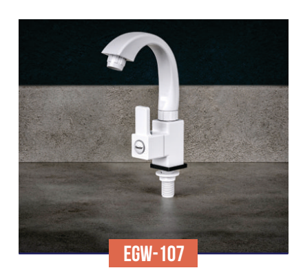
SWAN NECK MRP: Rs. 797.00