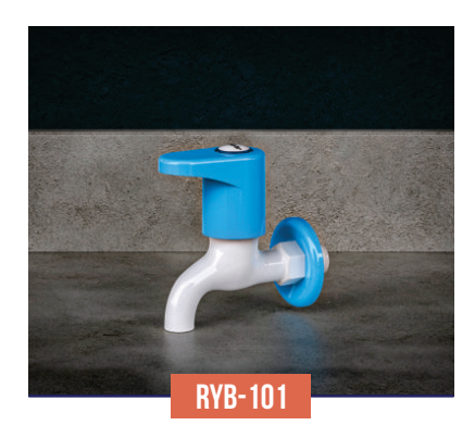
BIB COCK WITH FLANGE MRP: Rs. 221.00