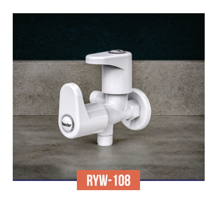
2 IN 1 ANGLE COCK WITH FLANGE MRP: Rs. 472.00