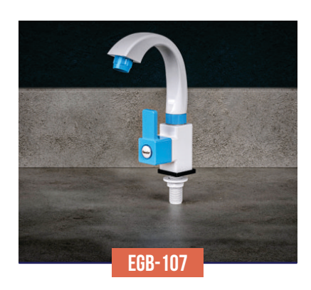
SWAN NECK MRP: Rs. 797.00