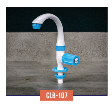
SWAN NECK MRP: Rs. 546.00