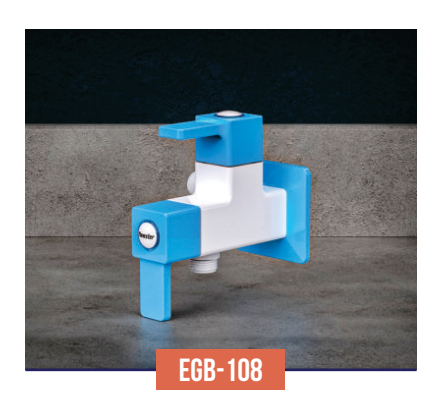
2 IN 1 ANGLE COCK WITH FLANGE MRP: Rs. 746.00