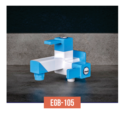
2 WAY BIB COCK WITH FLANGE MRP: Rs. 614.00