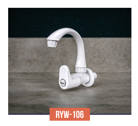
SINK COCK WITH FLANGE MRP: Rs. 600.00