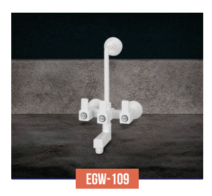
WALL MIXER WITH BEND MRP: Rs. 2246.00