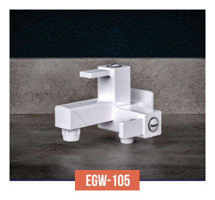
2 WAY BIB COCK WITH FLANGE MRP: Rs. 614.00