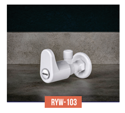
ANGULAR STOP COCK WITH FLANGE MRP: Rs. 234.00