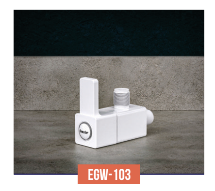
ANGULAR STOP COCK WITH FLANGE MRP: Rs. 295.00