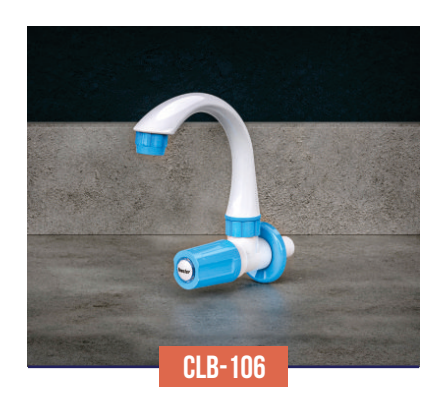
SINK COCK WITH FLANGE MRP: Rs. 533.00