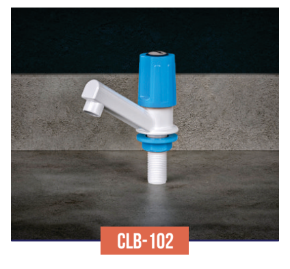
PILLER COCK MRP: Rs. 288.00