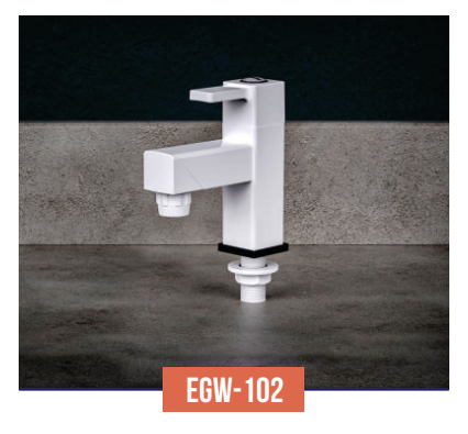
PILLER COCK MRP: Rs. 438.00