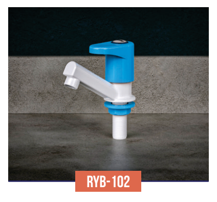
PILLER COCK MRP: Rs. 349.00