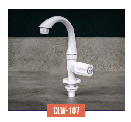
SWAN NECK MRP: Rs. 546.00