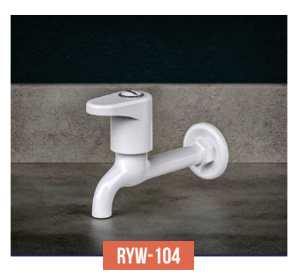
LONG BODY BIB COCK WITH FLANGE MRP: Rs. 299.00