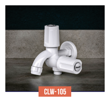
2 WAY BIB COCK WITH FLANGE MRP: Rs. 438.00