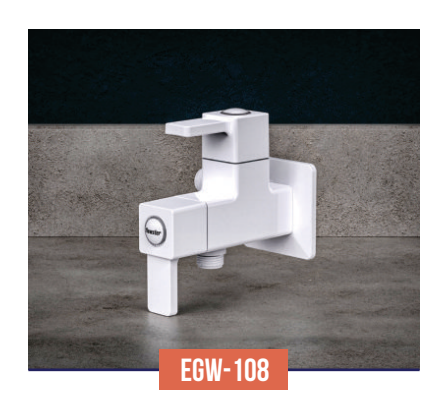
2 IN1 ANGLE COCK WITH FLANGE MRP: Rs. 746.00