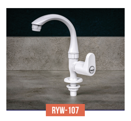
SWAN NECK MRP: Rs. 597.00